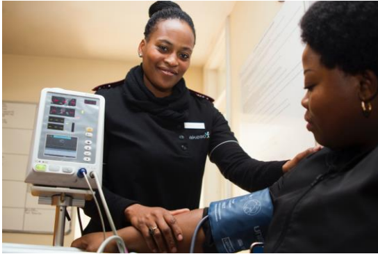
Healthcare worker checking a client's blood pressure.